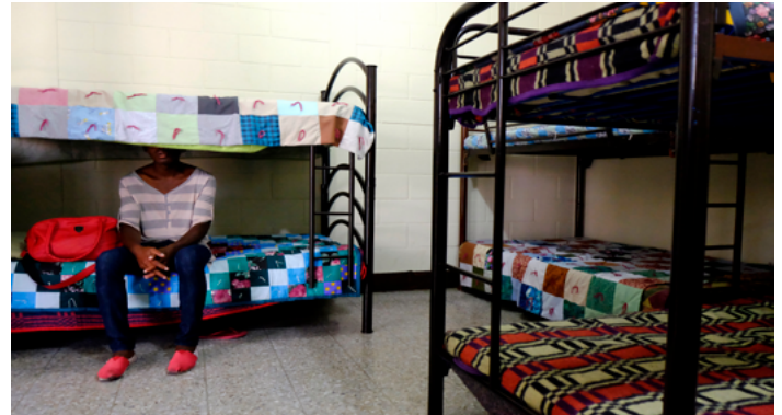
Niño/as de Paz, ACNUR, Ciudad de Guatemala, Casa del Migrante