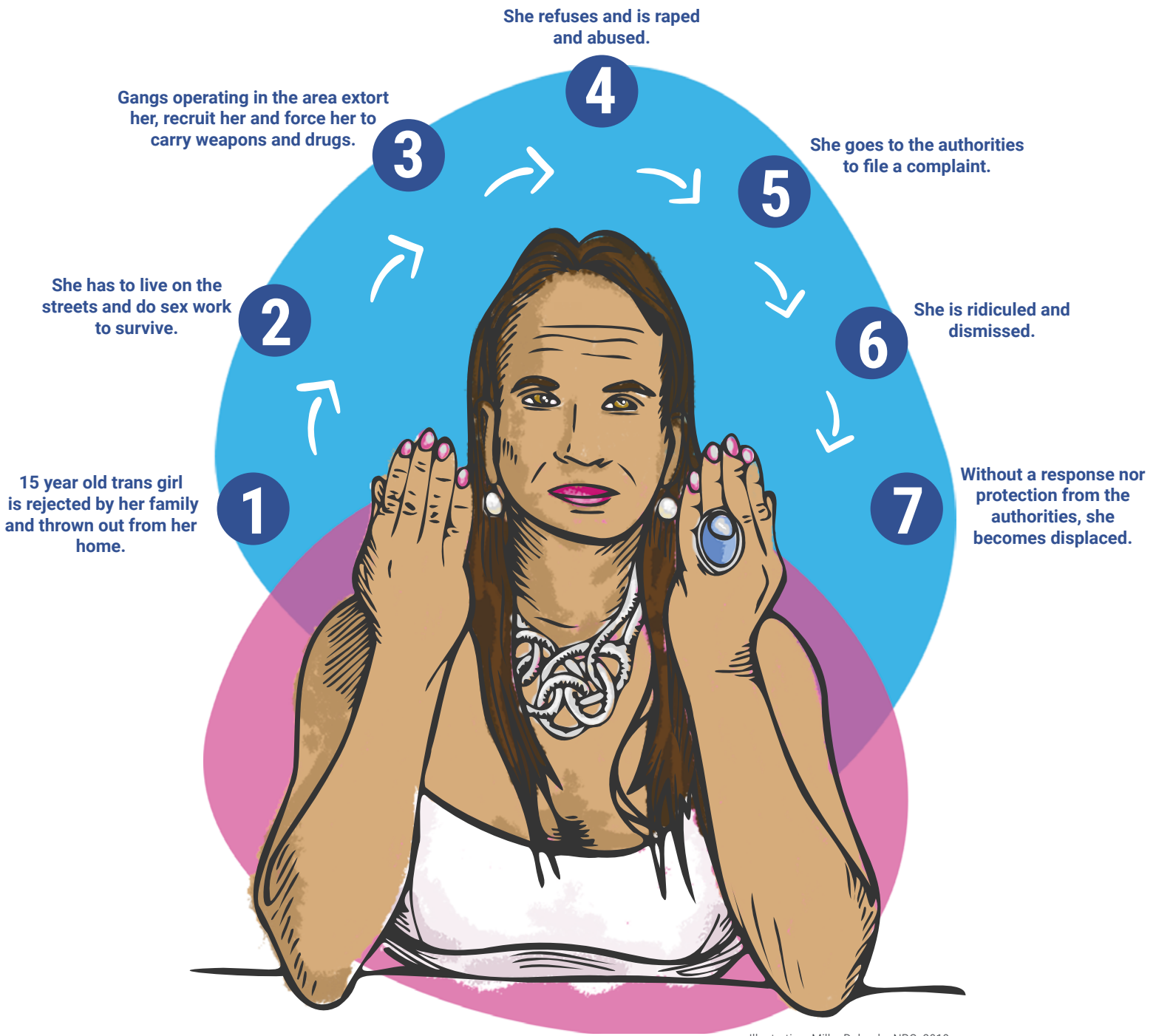
Illustration: Milko Delgado, NRC, 2019

According to the organisations interviewed, in general, LGBTI people in North of Central America are not subject to a single type of violence, isolated event or agent of persecution, but to a combination of several types of violence. This is in addition to structural violence, which hinders access to education, employment and basic services 14 . The few survival mechanisms available, such as sex work or displacement, are dangerous options and often place people at greater risk of abuse, trafficking, disease and human rights violations.