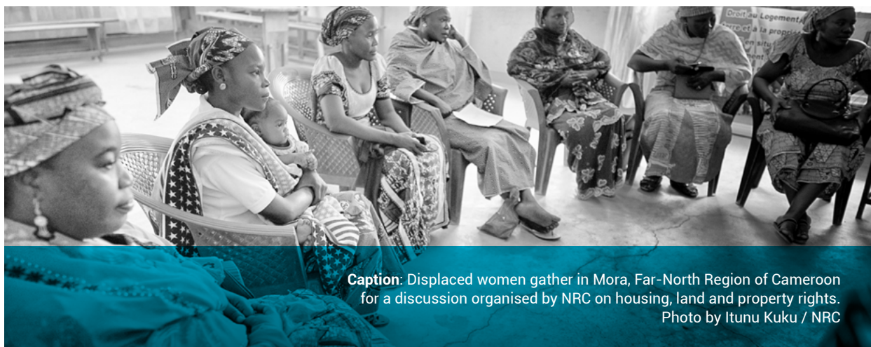
Caption: Displaced women gather in Mora, Far-North Region of Cameroon for a discussion organised by NRC on housing, land and property rights.