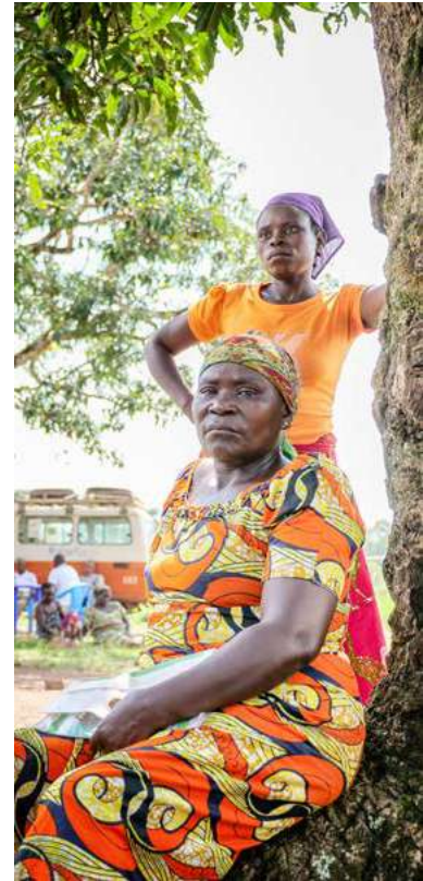
Caption: Two women pose for a photo after cash distribution exercise for construction of houses.

In the case of a non-legalised marriage, options for an evicted wife/ partner are mostly limited to filing a complaint with the local chief. Non-legalised marriages and co-habitation in Central African Republic are not recognised by law, making it extremely difficult to claim any rights over property that was purchased by the husband or built by the couple, but generally considered the property of the husband. In the absence of a marriage certificate, a wife or partner seeking to claim ownership over property will depend on her ability to demonstrate proof that she contributed to the purchase or construction of the house. Clearly, this is often extremely problematic.