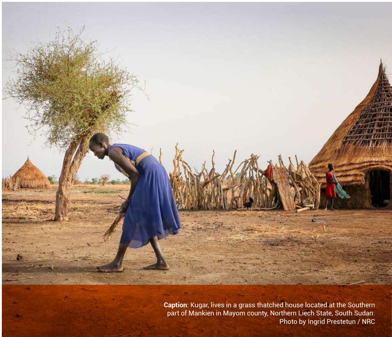
Caption: Kugar, lives in a grass thatched house located at the Southern part of Mankien in Mayom county, Northern Liech State, South Sudan.

Despite these limitations, the report offers an understanding of the HLP rights of displaced women in Africa, challenges and opportunities, and recommendations for improvement and learning, which builds on existing evidence on women's HLP rights in Africa, and will be used to inform advocacy, - and policy reform.