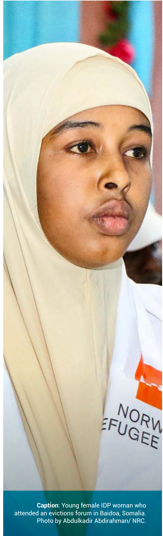
Caption: Young female IDP woman who attended an evictions forum in Baidoa, Somalia.

Additionally, everyone shall have the right to legitimate aims without monopolisation, deceit or harm to oneself or to others. 19 Everyone shall have the right to own property acquired in a legitimate way, and shall be entitled to the rights of ownership, without prejudice to oneself, others or to society in general. Expropriation is not permissible except for the requirements of public interest and upon payment of immediate and fair compensation. Confiscation and seizure of property is prohibited except for a necessity dictated by law. 20 All individuals are equal before the law, without distinction between the ruler and the ruled. The right to resort to justice is guaranteed to everyone. 21