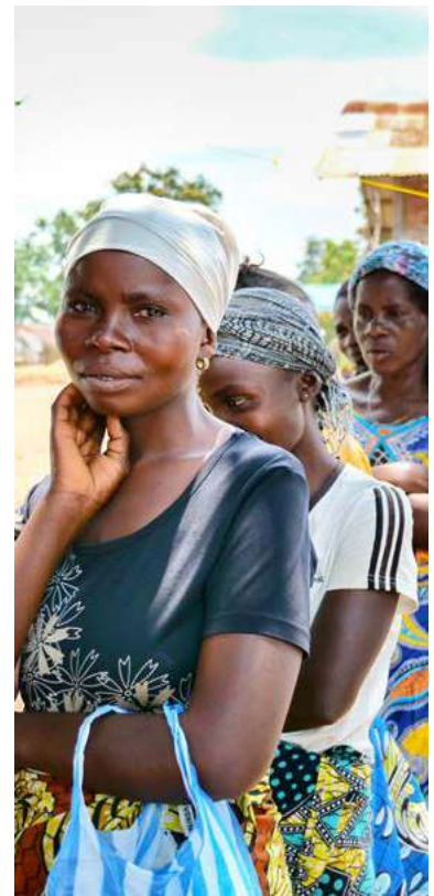
Caption: Community members in Ituri Province of the Democratic Republic of Congo line up patiently to receive the cash assistance that they will use to construct houses.

However, if women are displaced, the Convention specifically addresses the state’s responsibility to “take necessary measures to ensure that internally displaced persons are received, without discrimination of any kind and live in satisfactory conditions of safety, dignity and security.” Article 9 explicitly acknowledges that women often require special assistance, and stipulates that the states will provide special protection and assistance to IDPs with special needs, such as female heads of households and mothers with children, and will take special measures to ensure reproductive and sexual health of IDP women, as well as providing “psycho-social support for victims of sexual and other related abuses.” 28