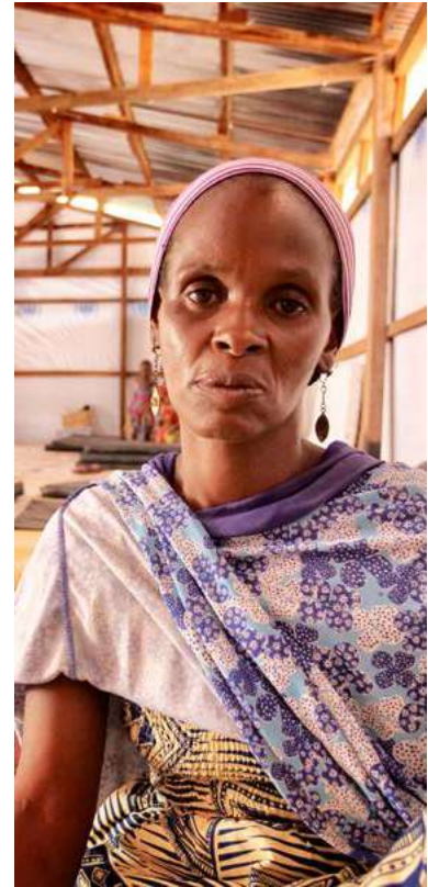
Caption: Female refugee who fled her village in Central African Republic to seek refuge in Cameroon poses for a photo at the reception centre.

In 2010, the Ministry of Social Affairs, National Solidarity and Family initiated a process to compare the family law with relevant national and international legislation and highlight possible contradictory or discriminatory provisions. Several challenges were identified and discussed at two workshops in Bangui in 2010. Since the law allows polygamy, 34 this was discussed at length and amendments were proposed. Provisions on succession and inheritance were not deemed to be discriminatory against women. However, the high number of co-habiting couples and lack of legal protection of partners was highlighted as a concern. 35 The status of proposed amendments to the law is currently unclear. 36