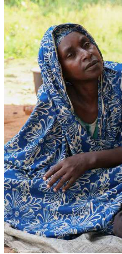
Caption: Refugee woman after fleeing her village in Central African Republic to seek refuge in Cameroon.

Displaced women should be empowered economically to enable them escape the cycle of poverty. This will increase their confidence and strength, and enables them to make independent choices without fear of abandonment, eviction, or divorce. Economic strength provides the