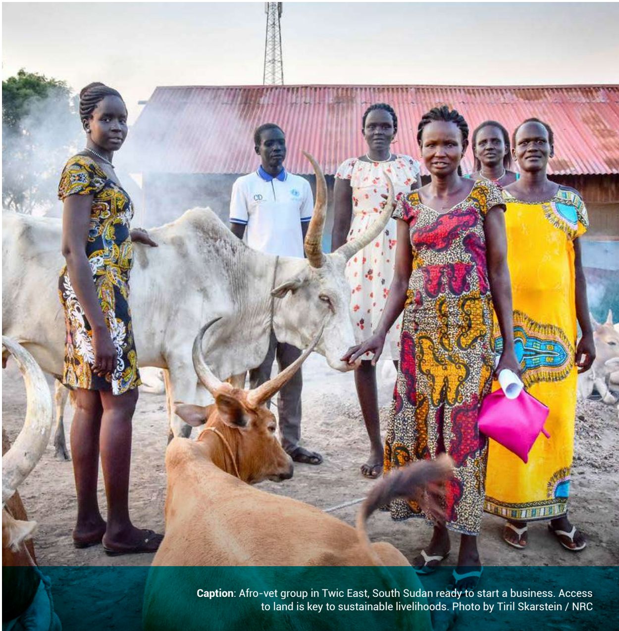
Caption: Afro-vet group in Twic East, South Sudan ready to start a business. Access to land is key to sustainable livelihoods.

They are a set of guidelines on how to address the complex issues around housing, land and property restitution. The Pinheiro Principles provide restitution practitioners, as well as states and UN and others agencies, with a consolidated text relating to the legal, policy, procedural, institutional and technical implementation mechanisms for housing and property restitution. As such, the Principles provide specific policy guidance regarding how to ensure the right to housing and property restitution in practice and for the implementation of restitution laws, programmes and policies, based on existing international human rights, humanitarian, refugee and national standards.