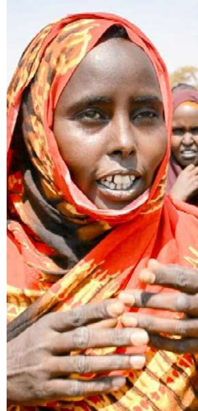
Caption: Female IDP woman explaining issues on housing, land and property in Dollow, Somalia.

International treaties are not self-executing and require domestic