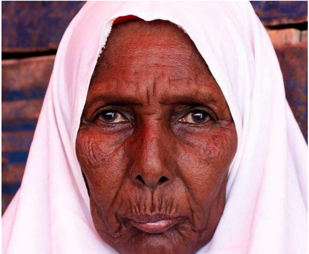
Caption: Portrait of IDP woman in Somalia.

Further still, in Africa, civil strife has exacerbated women's insecurity and inability to access their land and also increased tensions between communities. For example, in Cote D'Ivoire , the women from the autochthonous and migrant communities have had their rights to land threatened by civil strife. Widows, divorced, and abandoned women are perhaps the most vulnerable, often being forced to leave their deceased husbands' land, or to marry an in-law or another villager in order to remain in their community and with their children. While the statutory land tenure framework does not exclude women from legally owning land, very few do. Additionally, under the customary system in Cote D'Ivoire , women are prevented from owning and inheriting land, which often results in their exclusion from land registration processes. 103