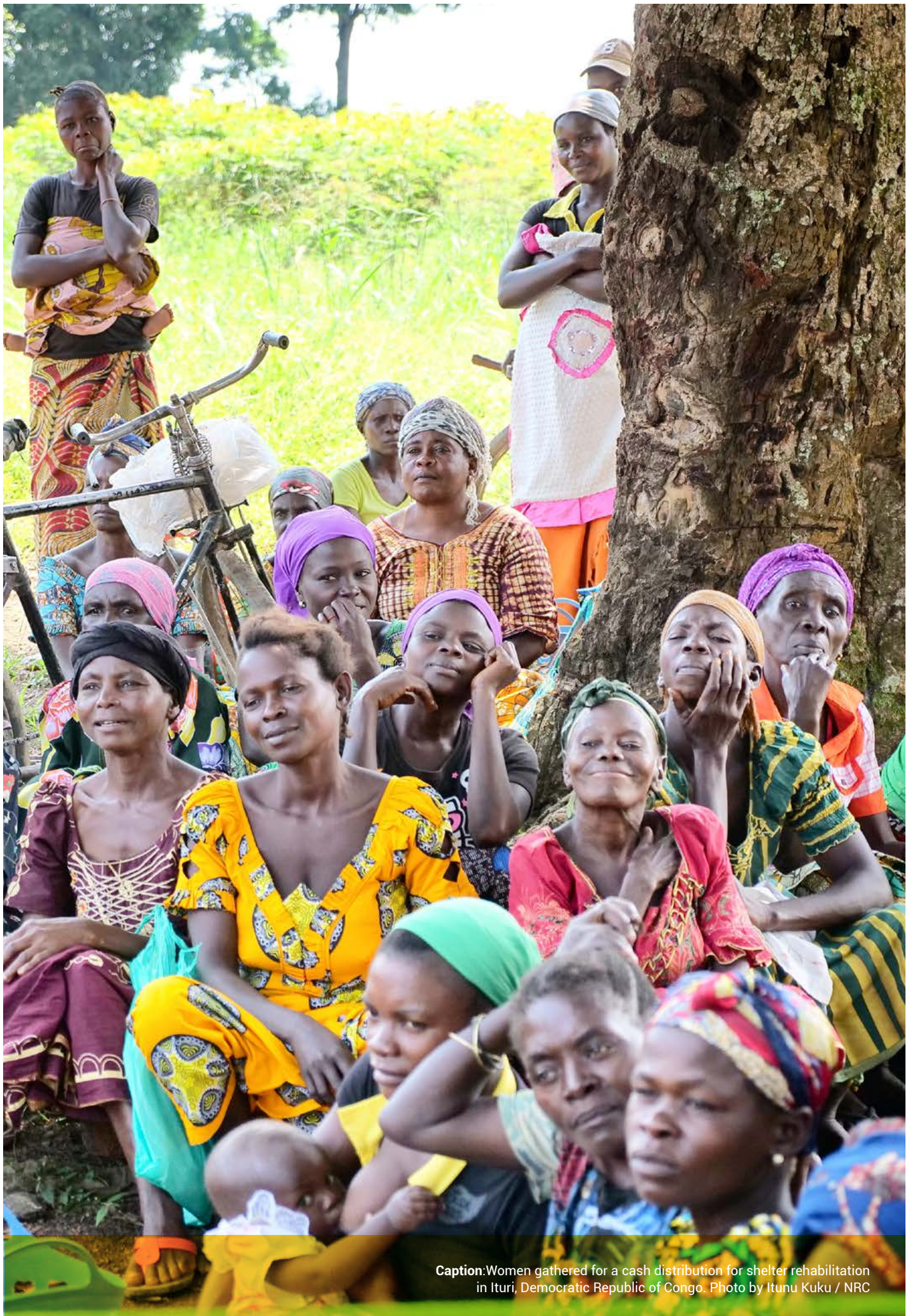
Caption: Women gathered for a cash distribution for shelter rehabilitation in Ituri, Democratic Republic of Congo.