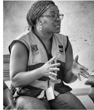
Caption: Clementine speaks to displaced women gathered in Mora, Far-North Region of Cameroon during a discussion organised by NRC on housing, land and property rights.

The right to adequate housing (which includes the component of security of tenure) is protected by Article 11(1) of the ICESCR, and includes an obligation on the part of states to, at a minimum, refrain from violating such rights through their actions, and to take reasonable measures to prevent foreseeable violations by non-state actors.