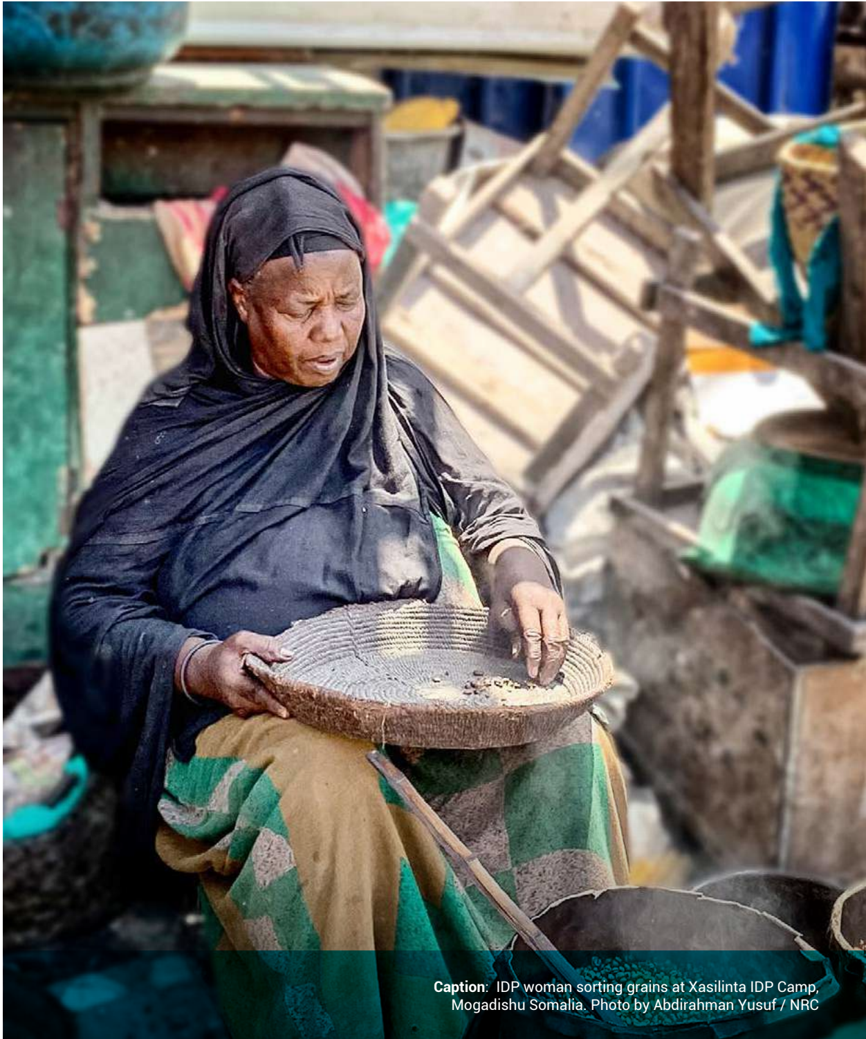
Caption: IDP woman sorting grains at Xasilinta IDP Camp, Mogadishu Somalia.

under the Constitution, other applicable national laws and international human rights instruments; and (b) appropriate measures shall be taken to ensure that adequate alternative shelter is made available to those unable to provide for themselves and, in particular, women, children, persons with disabilities or chronic illness, and the elderly. 84